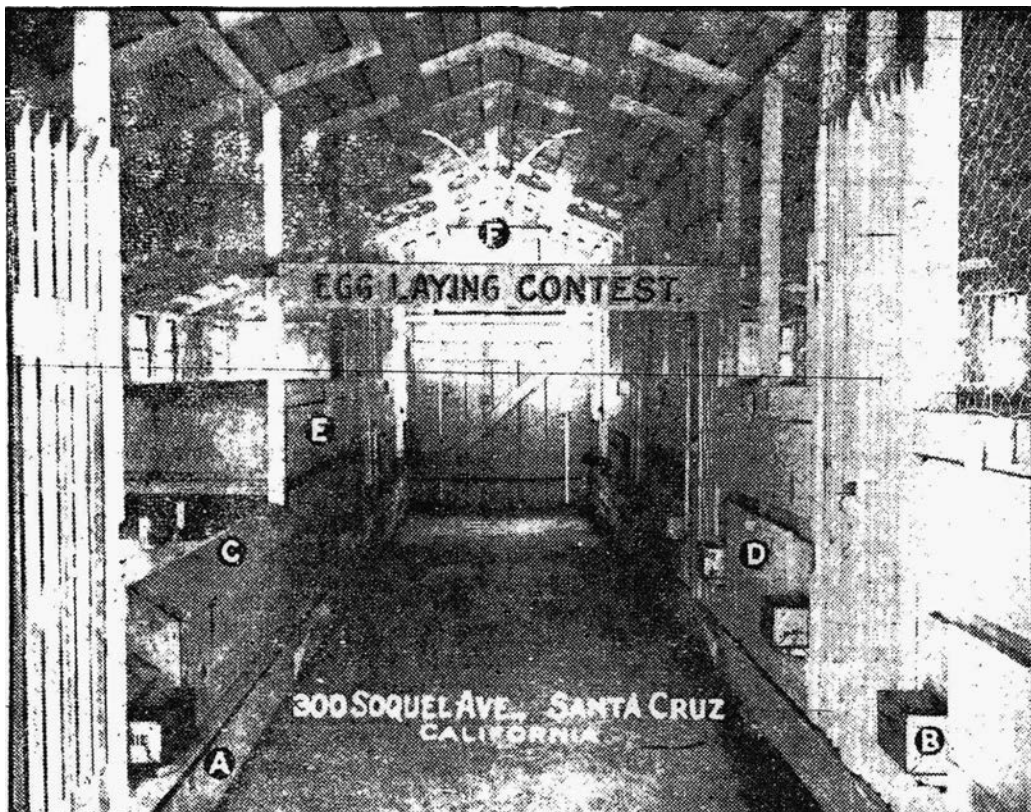
Inside the Smith Model Poultry House. Letters indicate its features: A) grain & green-feed trough; B) water pan; C) mash hopper; D) board in front of nest boxes, E) hinged floor allows pens to be cleaned; F) ventilation feature. ("Santa Cruz County Hen Demonstrating Herself," Santa Cruz Sentinel , December 5, 1918)